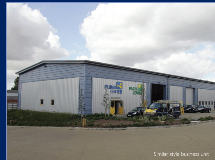
Similar style business unit