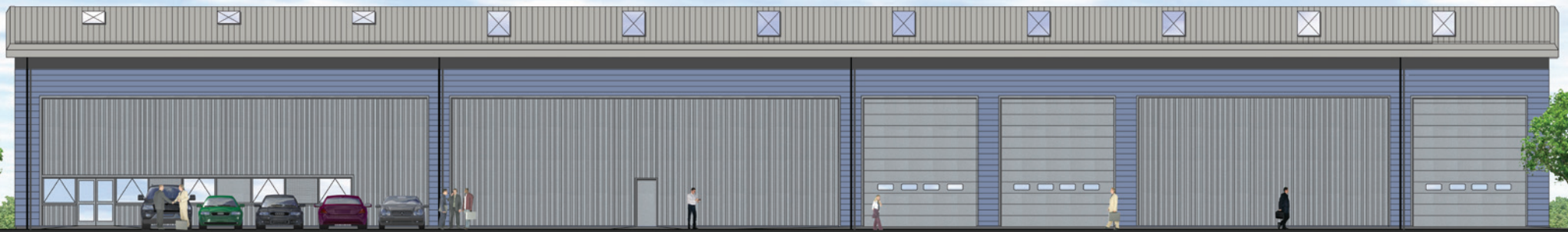
Computer generated image only whereby final visual may differ subject to actual subdivision

Pre-let or sale on whole/part is sought NEW BUSINESS UNITS TO BE CONSTRUCTED